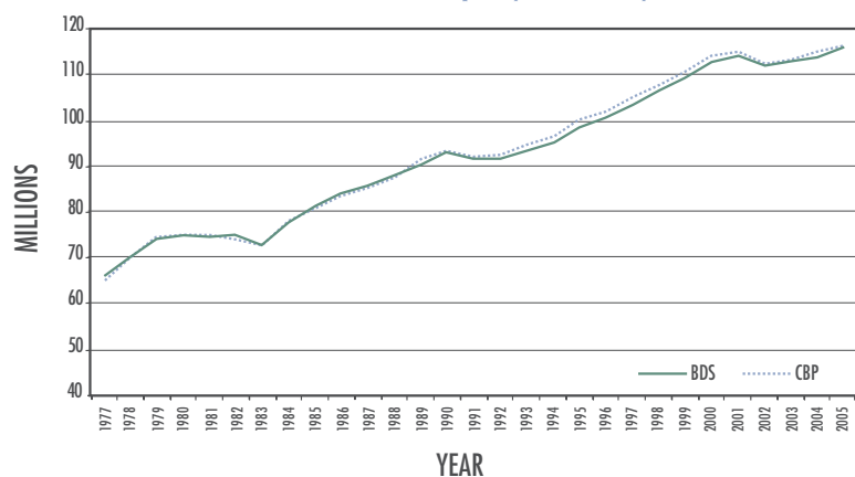
Figure 1 CBP vs. BDS Employment by Year

Although the BDS is based on the same basic source data as the Census Bureau CBP and Statistics of U.S. Business programs, differences in how the source data are processed lead to differences in the published statistics.